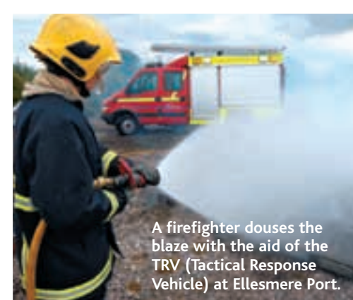
A firefighter douses the blaze with the aid of the TRV (Tactical Response Vehicle) at Ellesmere Port.

BONFIRE HOTLINE 0300 123 7026 Call for removal of illegal bonfires