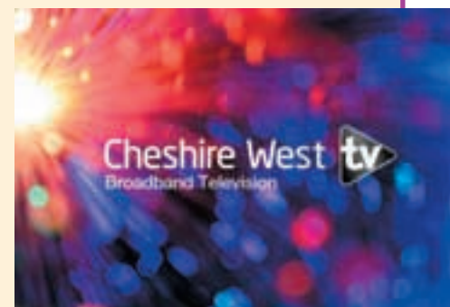
The stylish branding of West Cheshire's new broadband TV service.

Talking Together is published by West Cheshire Together, a partnership of Cheshire West and Chester Council, Cheshire Police, Cheshire Fire and Rescue Service, Cheshire Police Authority and NHS Western Cheshire.