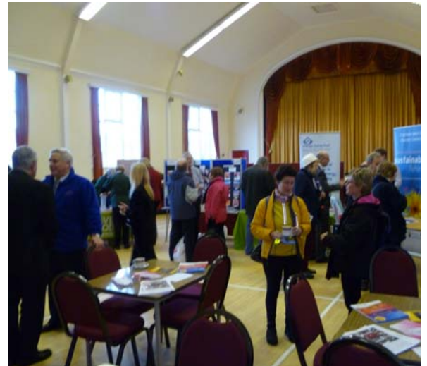
Below Neston residents considering options for the town Centre

The Community Forum meeting held at Neston Town Hall in January had a sustainability and biodiversity theme. Organisations and Council Services such as The Energy Saving Trust, Cheshire Fire & Rescue Service, Community Wardens, Cycling Chester, Love Food Hate Waste, Recycling Volunteers and others were on hand to talk to residents about the practical actions that can be taken to improve our environment.