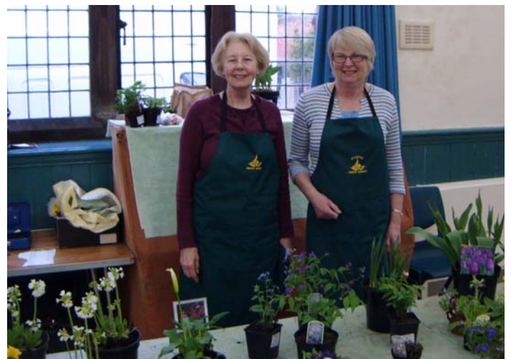
Above stall holders at Willaston Country Market

Country Market food is produced at home and is freshly prepared, additive and preservative free under strict hygiene and packaging regulations, with full traceability.