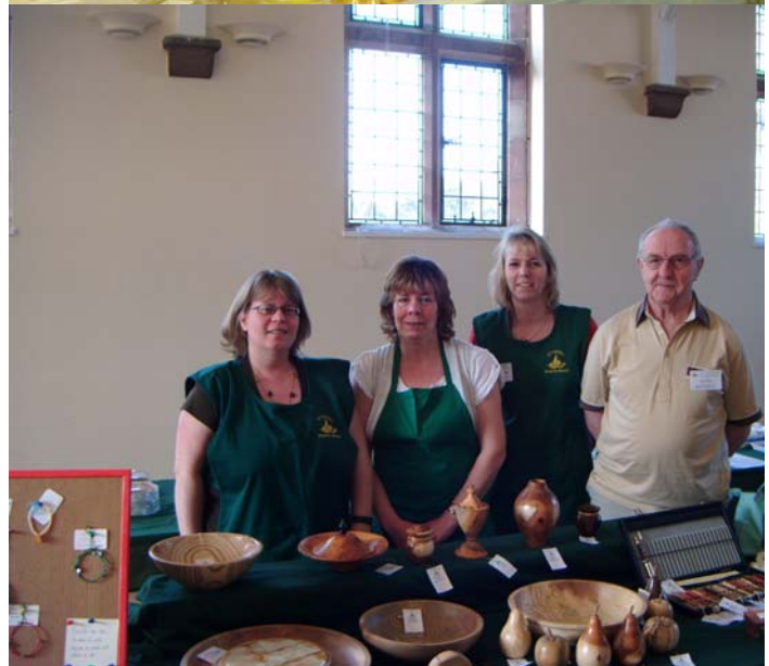
Above stall folders at Farndon and Tattenhall Country Markets – Why not go along, have a coffee and see what's on offer!