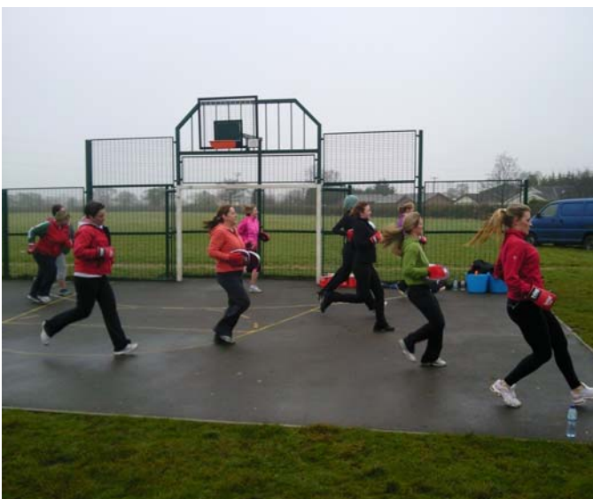
Boot Camp at Saughall