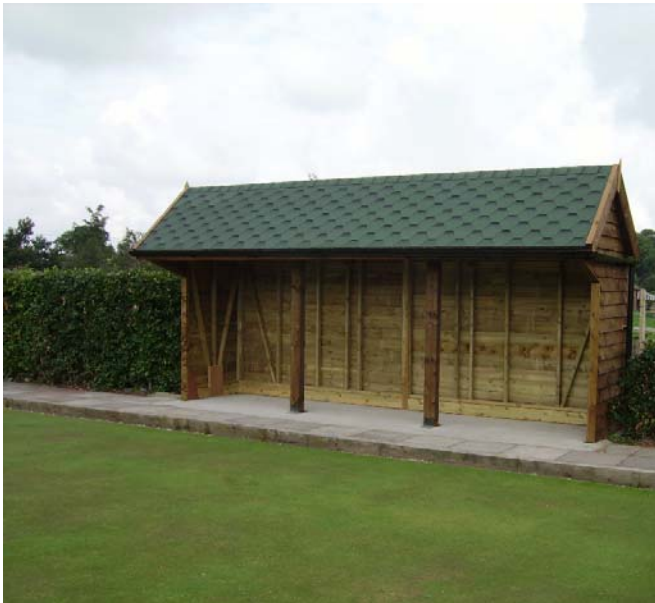
New Bowling Green at Waverton

Over the summer groups used the funding to deliver various activities which all aim to improve the health and wellbeing of local communities.