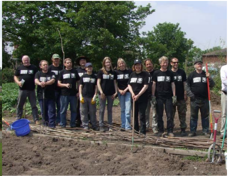
Members of British Trust Conservation Volunteers time to grow project