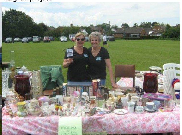
Village sports and market day in Willaston